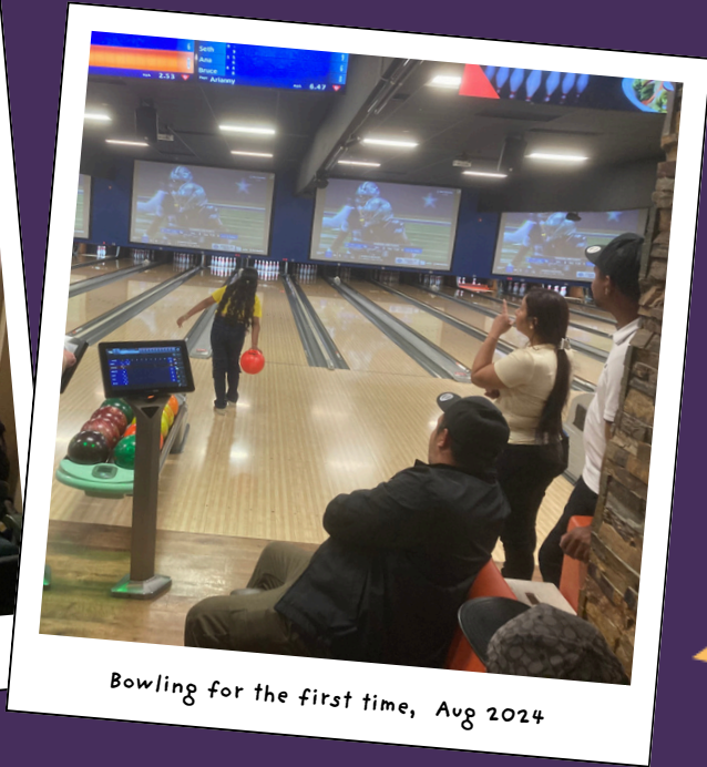
Bowling for the first time, Aug 2024