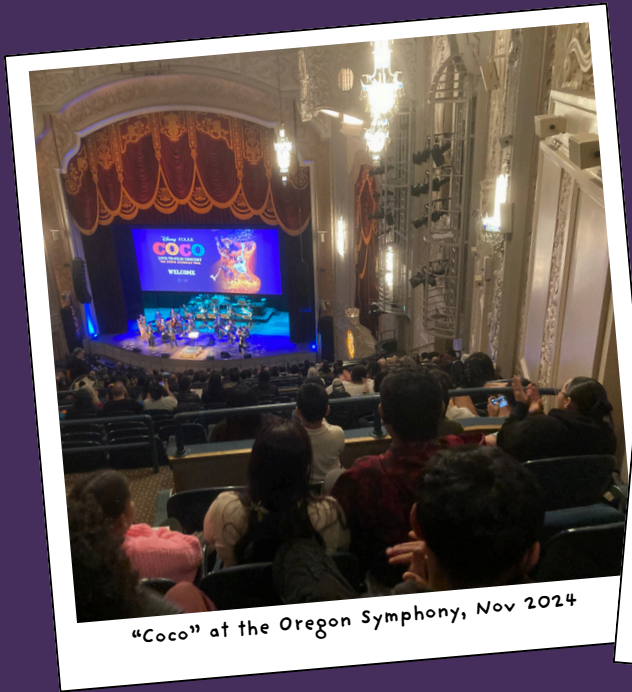
"Coco" at the Oregon Symphony, Nov 2024