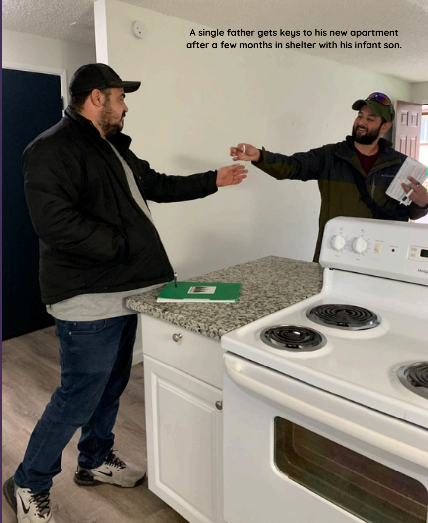
A single father gets keys to his new apartment after a few months in shelter with his infant son.

2 churches joined our network of 9 host partners